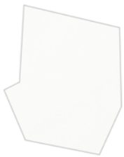
PM201 Glacier White